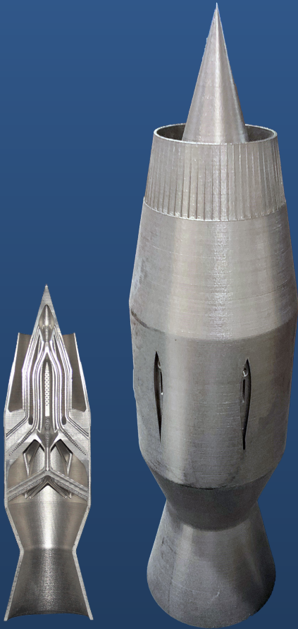
Hypersonic ramjet engine produced in conjunction with Lockheed Martin for The Department of Defense's Lightweight Innovations For Tomorrow (LIFT) Institute. The engine features integrated complex internal flow channels, printed on a Velo3D Sapphire 1MZ printer.

Velo3D's product offering is the only one in our category that combines hardware, software, and underlying manufacturing processes to create a fully-integrated solution that easily incorporates into traditional manufacturing ecosystems.